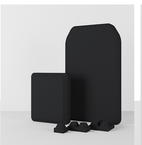
Hardware Development Tactile Sensors

Provide the Human Sense of Touch to Robots